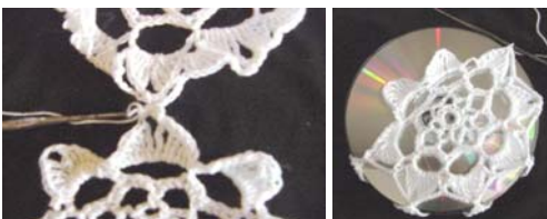
Connect with a sc through both pieces.

Rnd 7: Sl st 5 to next 2 ch loop, ch 1, sc in loop, connect with 1 sc to any center point (between the 2 sc) on Piece 1 (see picture), 1 sc in working piece, ch 5, 1 sc in next 4 ch loop, ch 5, [1 sc in next 2 ch loop, 1 sc connecting Piece 1, 1 sc in same st, ch 5, 1 sc in next 4 ch loop, ch 5] 4 times, then slip 2 CD (silver on the outside) between the two working pieces, then [1 sc in next 2 ch loop, 1 sc connecting to Piece 1, 1 sc in same st, ch 5, 1 sc in next 4 ch loop, ch 5] 3 times, connect with sl st in first ch. Fasten off, leave a long end to use for hanger.